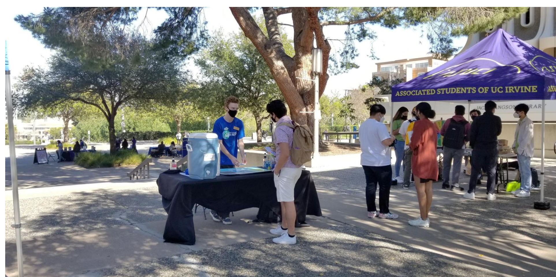
Shows student guests visiting booths at the event.