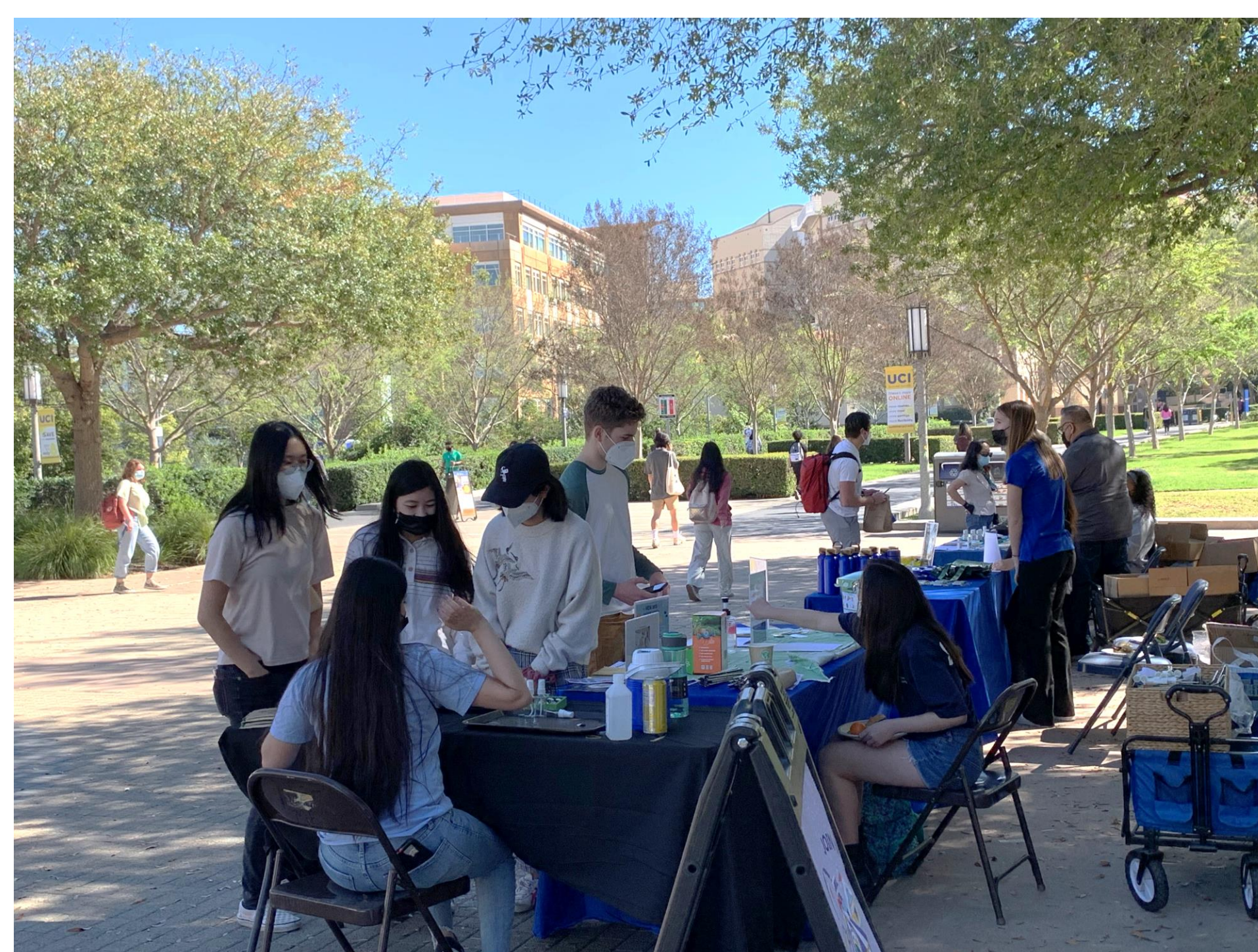
Shows student guests visiting booths at the event.

My main responsibility was the organization of the Sustainival, which took place on February 14, 2022, from 11 AM to 2 PM. The Sustainival is an event put on annually by the Sustainability Resource Center at UCI to encourage students to think critically about sustainability issues on campus. Students have the opportunity to meet many campus and community organizations to learn about their mission statements and work. In addition, the event provides many opportunities for students to get involved with sustainability projects on campus.