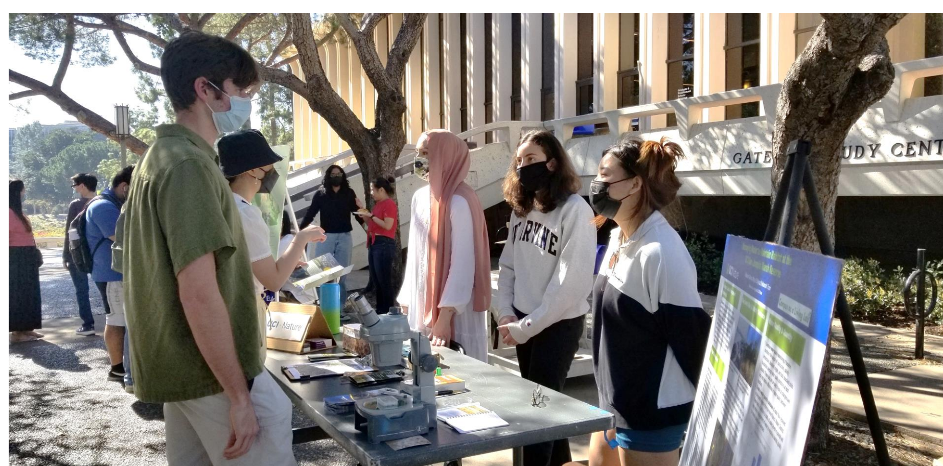
Shows student guests talking with a campus organization's booth.

My time as UCI's CNI Student Engagement Fellow provided me with excellent leadership, communication, organizational, and planning skills which I seek to use throughout my academic and professional careers.